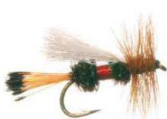
Trude Wing Style