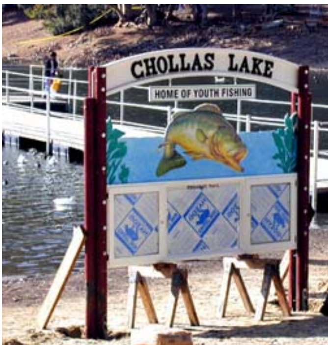
Finally, in the ground, looking good.