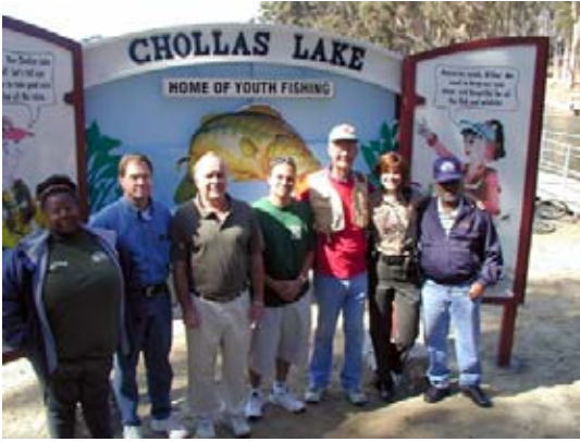
The SDFF sponsored educational kiosk is formally dedicated at Lake Chollas on February 22, 2003.