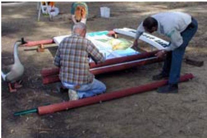
Bolting it together with Clifford's supervision.