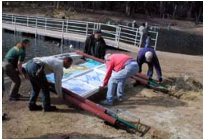
Heave Ho, let's get it in the ground.