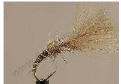
Olive Hare's Ear Shuttle Cock Emerger - size 12, 14, 18