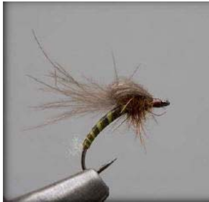
Biot & CDC Emerger - Blue Wing Olive

The Biot Midge resembles a variety insects and is great searching fly that works when the fish are being difficult to catch.