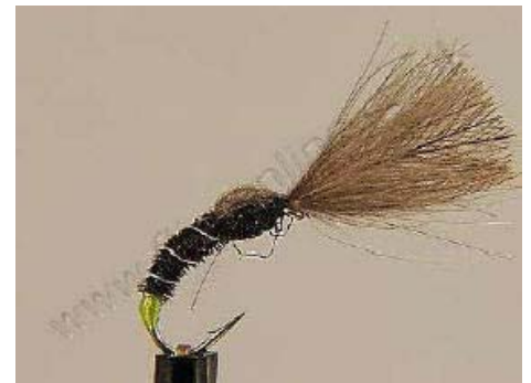
Green Tag Shuttle Cock Emerger

This one is tied with the olive goose biot ridge down. It would look different if the ridge was pointed up. Note this version has a small tuft of CDC or poly yarn as an anal gill. The hook is a TMC 200R - size 18 to 24, Brown 8/0 thread. Dun CDC puff.