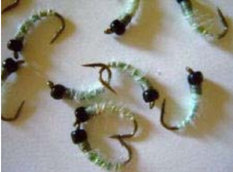
Glass Bead Grey Biot Midges size 14, 16 or 18

Simple tie, looks very good...you could play with the colors to imitate many naturals. Nice triggers. To make this an emerging midge add a small white or cream CDC puff at the hook eye and cover the butt end with the fine dubbing.